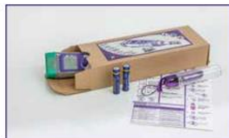
PC 5 Ecopack