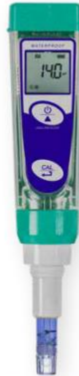
Tester PH2620/PH 1