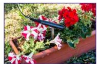
Soil conductivity with VPT Soil