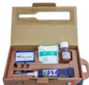
Kit EC2630/COND 5